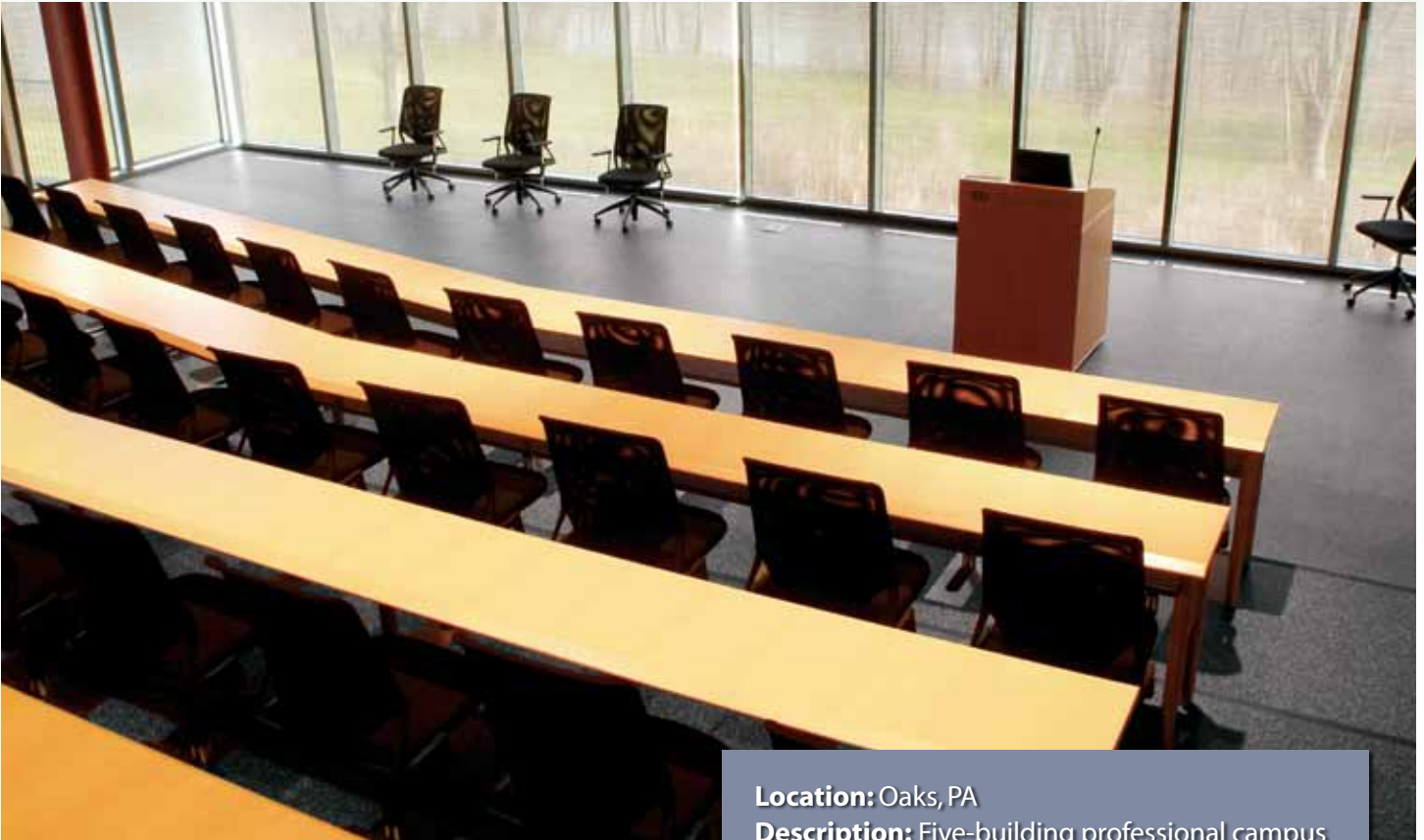
SEI Investments, Oaks, PA